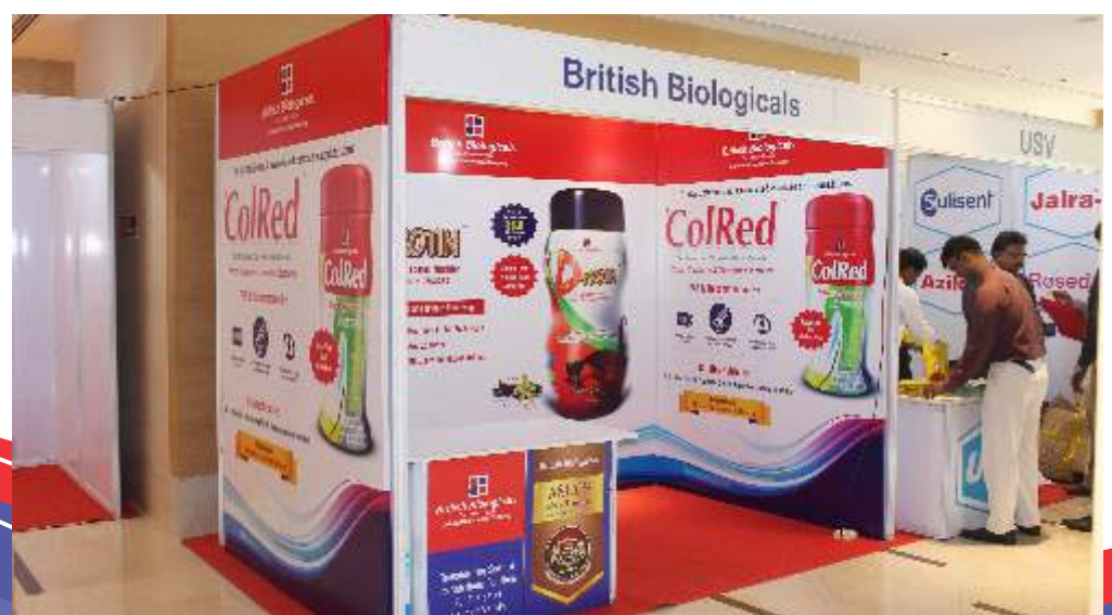
British Biologicals at GCDC 2017