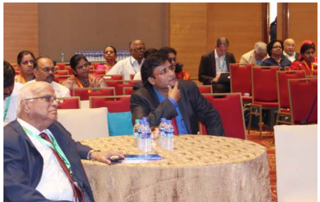
Scientific session in progress