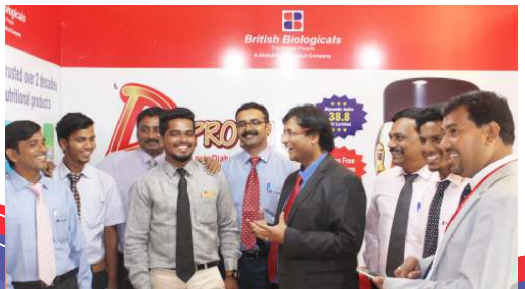
Team British Biologicals at GCDC 2017