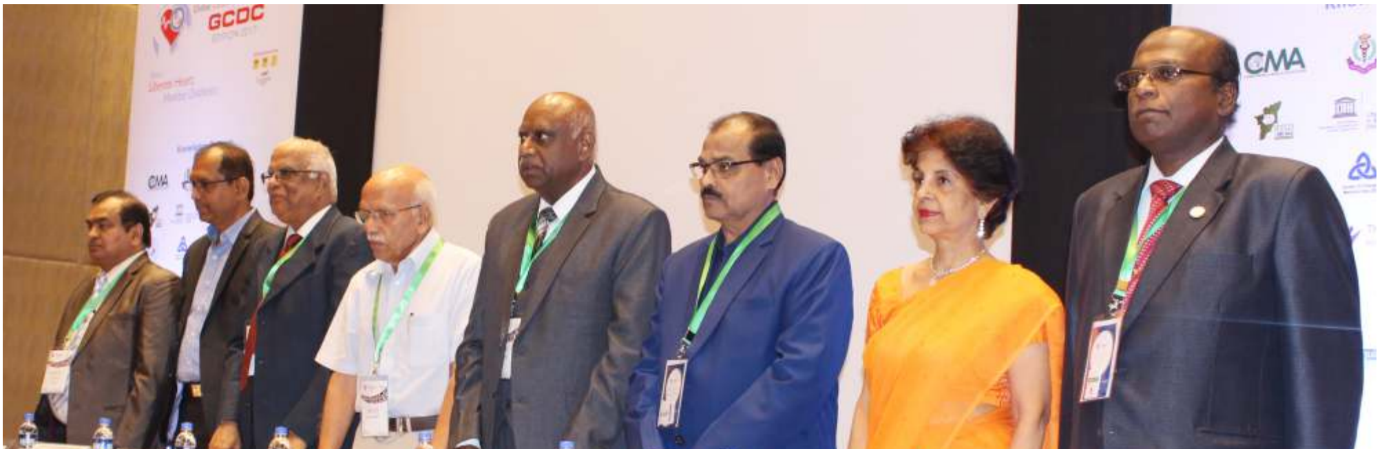
Delegates at GCDC 2017

British Biologicals The Protein People A Global Nutraceutical Company